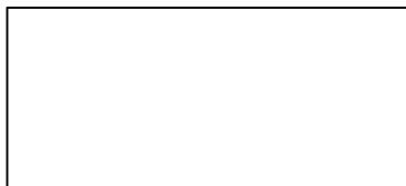
MOUNT LOCATION PLAN VIEW